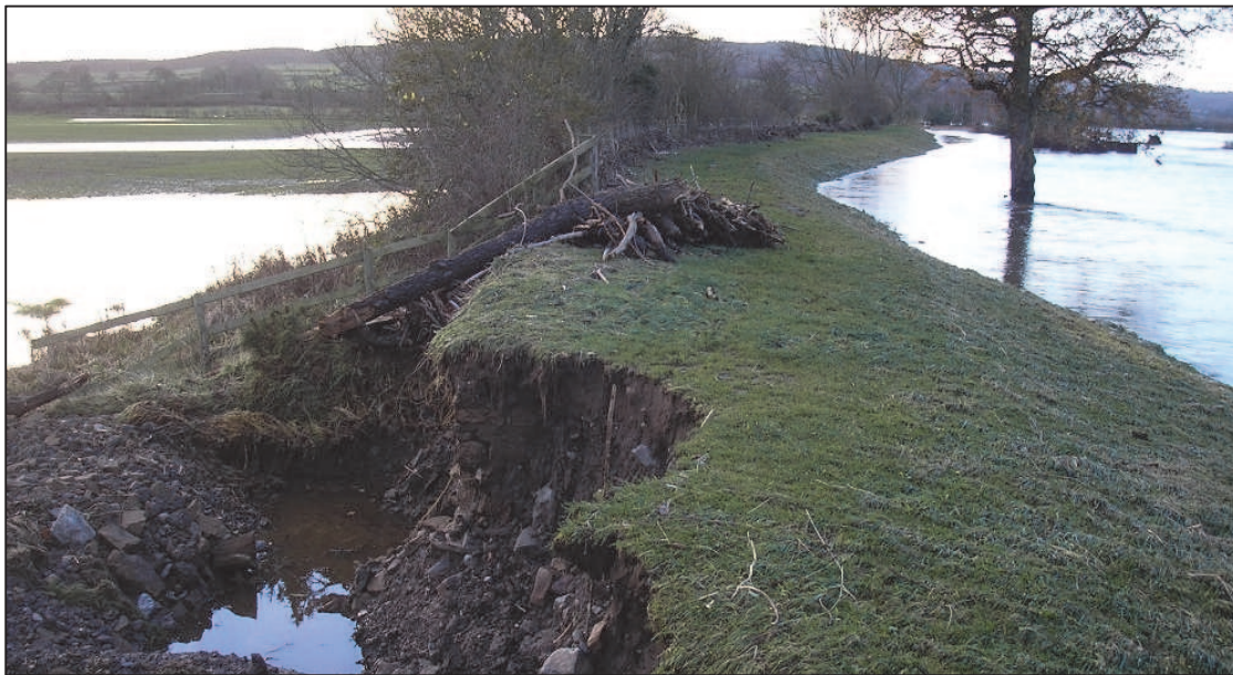
Fig. 8: Damage to Corbridge flood bund