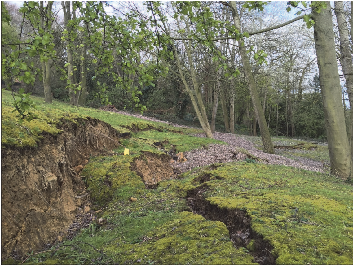
Fig. 7: Eastern half of Collingham bank slip