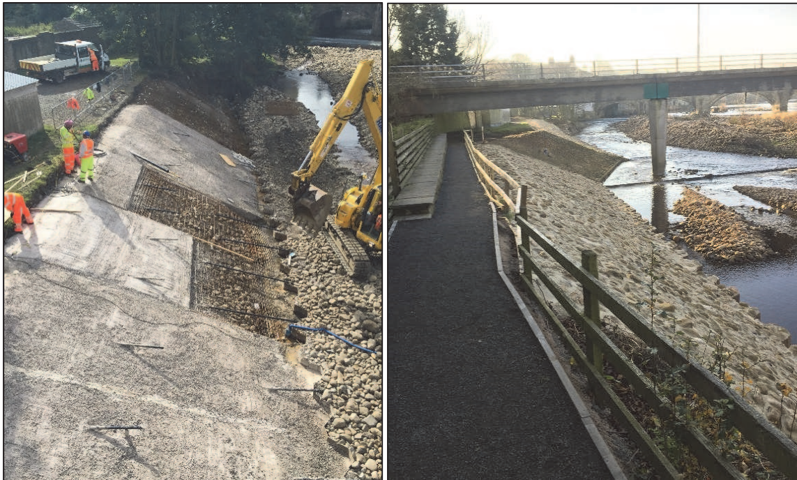
Fig. 6: Haydon Bridge reinforced concrete stone pitching revetment with sheet piles at toe.

This site was on a critical programme due to salmon migrating upstream in the autumn and all temporary works in the river were completed before the end of September. This site included working with other partners to address recovery to assets other than flood defences, including stone pitching repair to scour upstream of the bridge to protect a NWL sewer and underpinning the highway bridge concrete apron which was being under mined by scour.