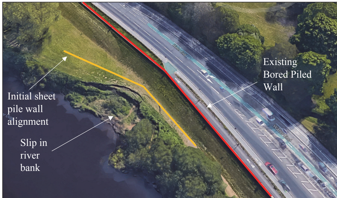
Fig. 5: Water End river bank failure

Water End is a modern flood wall (constructed in 2011) sitting on top of 600mm diameter bored piles at 2m centres at the crest of a road embankment behind a river bank. A slip occurred immediately after Storm Eva peaked, during rapid drawdown conditions. The slip threatened the stability of the road side flood wall and the integrity of several buried services. BMMJV designed and constructed a sheet piled wall and counterfort drains on the foreshore in November 2016.