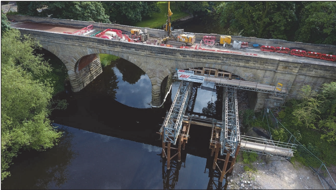
Fig. 3: Temporary support scaffolding and permanent piling works at Linton Bridge

Remedial works comprised emergency underpinning, temporary piled scaffold to support the south arch for permanent construction works, as illustrated in Figure 3 above, and the design and construction of a new integral bridge deck with mini piles through each abutment and pier. This achieved a strengthened bridge, with lower maintenance liability without compromising the original character of the listed structure.